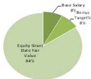
CEO Total Compensation Mix (1)