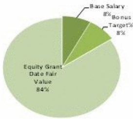
CEO Total Compensation Mix (1)