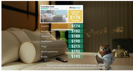
(View all our current and past television commercials here)

Our brand refresh and product launch paved the way for a return to offline brand advertising. In mid-June, we launched our global campaign in the U.S., followed by Canada, France, Spain, the U.K. and, in early July, Australia.